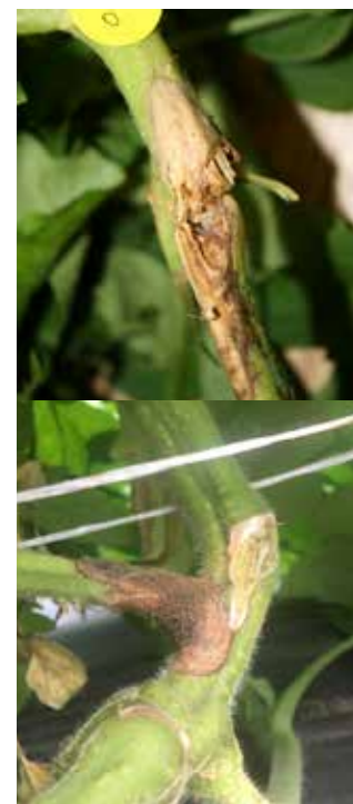
Botrytis stem rot of tomato.