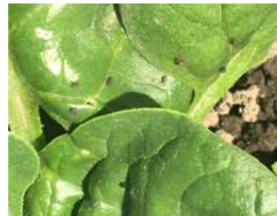
Garden springtail.

Seed Corn Maggot: maggots were found in an onion crop in Middlesex Co., but not in peas on this farm because the grower pre-sprouted their peas before planting. Elsewhere in Middlesex Co., seed corn maggot pupae were found in a field of peas where they had preferred sugar snap peas (no germination) over shelling peas and snow peas (some skips in the row but fairly good germination).