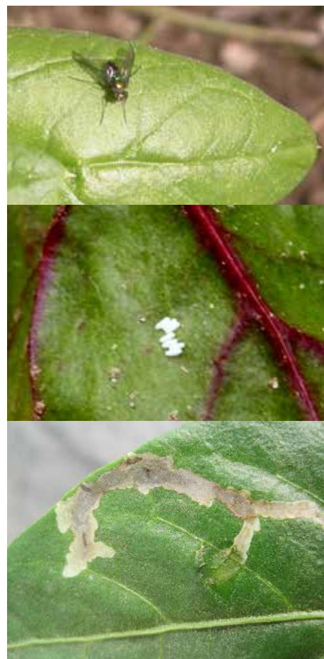
Leafminer fly, eggs, and early tunneling damage.

If the plants are infested early and populations are high, the losses from this pest may be great. This may be especially true when eggs on transplants in the greenhouse go unnoticed until planting in the field, resulting in infestations in row-covered crops. Treat when eggs or first tiny tunnels are noticed—see current recommendations below. There are both conventional and organic products available and in both cases an adjuvant is recommended to improve efficacy. See New England Vegetable Management Guide for more details on products. Many