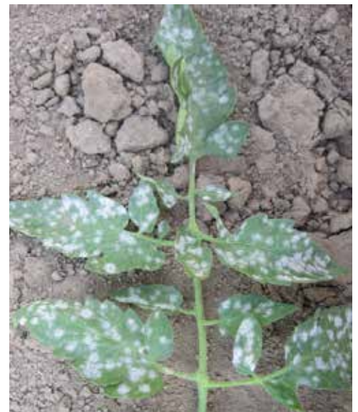
Powdery mildew on tomato causes white spots on foliage and can cover leaves and plants quickly under the right conditions.

Cultural practices to add to the powdery mildew management program include using wide within row and between row spacing of plants and removing lower